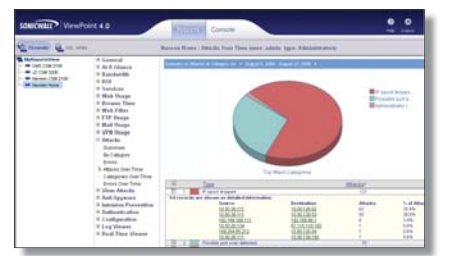
Attack Summary Collect information on thwarted attacks using SonicWALL subscription services.

Administrators can view all aspects of Web usage behavior throughout the network. Find out how much time employees spend surfing Web sites, discover exactly what Web sites were accessed at what time and reveal hidden usage patterns.